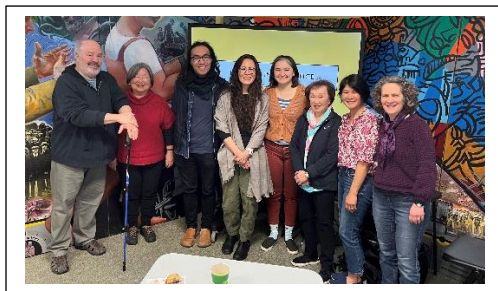
Some of the attendees of the April 6 ESFL event